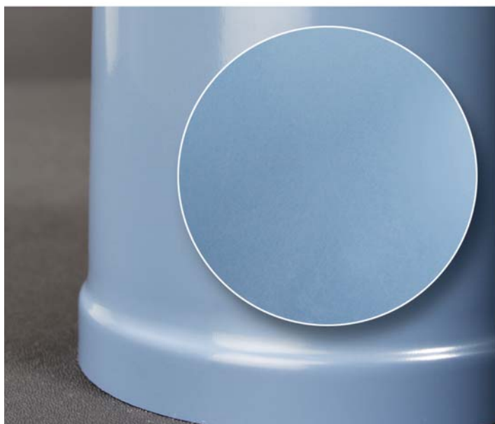
Part formed with KYDEX® sheet