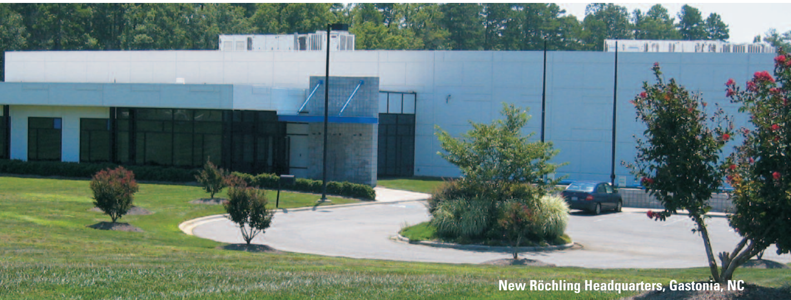
New Röchling Headquarters, Gastonia, NC

Effective October 1, 2008, Röchling Engineered Plastics and Röchling Sustaplast will be consolidating their product lines to provide our distributors with the conveniences and cost savings of a one-stop-shopping experience and additional services customized to your needs.